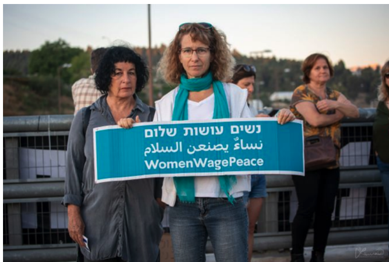
Pictured: An Arab and Jewish woman stand by a sign that reads “women wage peace” in Hebrew, Arabic, and English. From: On a bridge near Abu Gosh, Arabs and Jews showed me a better way

We cannot ignore the political determinants of health . Power may be pursued for its own sake sometimes without the motive of profit or material benefit. It is harder for the public health community to consider ourselves knowledgeable and able to stand up against this – being told it is outside our remit and understanding – but understand we must and we must be prepared to bring people together, to be a bridge for peace. We must forge alliances with international lawyers and political scientists and with organisations skilled in mediation and collaboration. We must try to understand the core motivations of those in power and how they work against the interests of health and fairness. We must call on the body of international learning on conflict resolution and apply all its principles to bringing conflicting parties together .