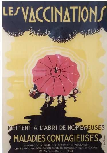
Pictured: Les Vaccinations. Poster from the Historical Archives of the French School of Public Health (EHESP)

transmission both between and within countries. Failure to address underlying structural and systemic inequalities in the acquisition and delivery of vaccinations is a fundamental ethical and moral concern. Additionally, there is a strategic imperative with pragmatic consequences in ensuring other vital goals of comprehensive global vaccination. These include: supporting sustainable economic development; allowing international travel/movement; and restoring adequate, accessible health and social care systems for all populations worldwide.