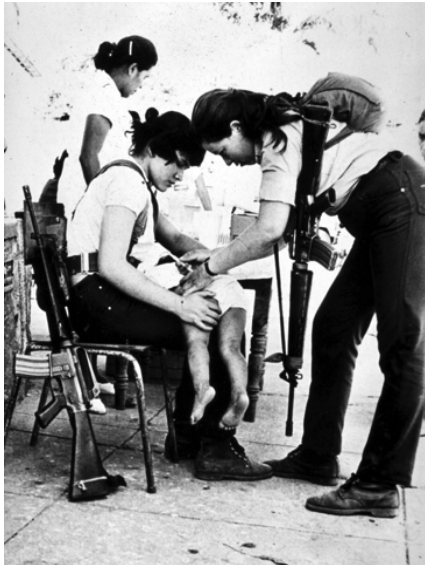
Pictured: Guerrillas in El Salvador participating in immunisation campaign. From Health as a Bridge for Peace: PAHO's experience , The Lancet

ASPHER's calls to the Israeli government to vaccinate Palestinians is in that category – the 'band aid for a broken leg'. Although I understand that sentiment, it is also the case that failure to vaccinate Palestinians, has been, to quote one Israeli colleague, 'another opportunity engendering anger and resentment'. This is particularly the case when Israel has been exporting surplus vaccine to other nations, buying influence through vaccine diplomacy . The Israeli government has also failed to heed ASPHER and Israeli Physicians for Human Rights calls for fair and equal treatment of Palestinians during the pandemic .