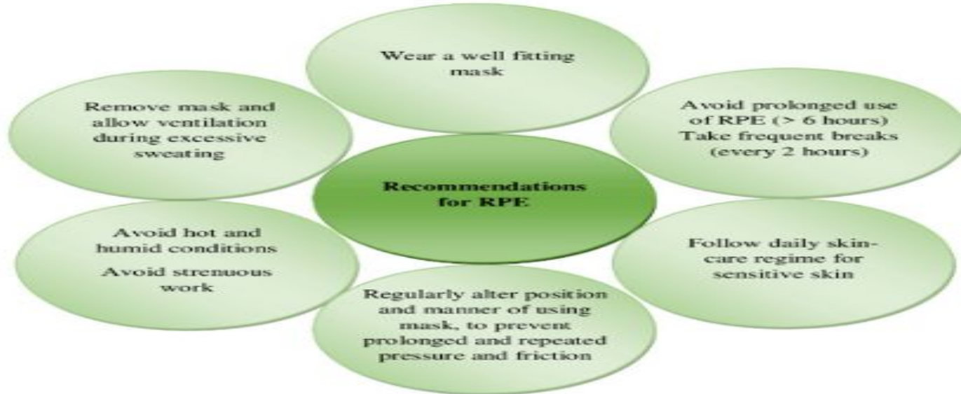
Figure 3. Recommendations for wearing respiratory protective equipment (RPE) (surgical masks and respirators).