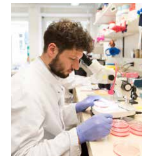
Doctoral and PhD Programmes