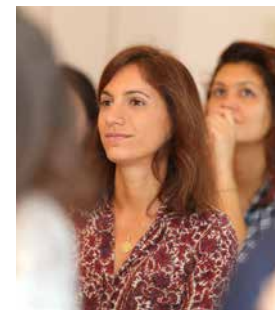
Undergraduate and Master Programmes