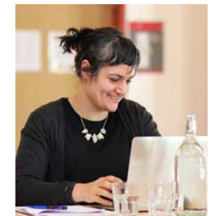
Professional Post-graduate Programmes