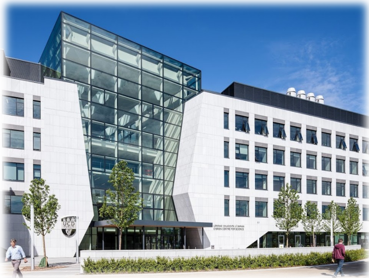
UCD CTC Belfield

Over 500 days of service since March 2020