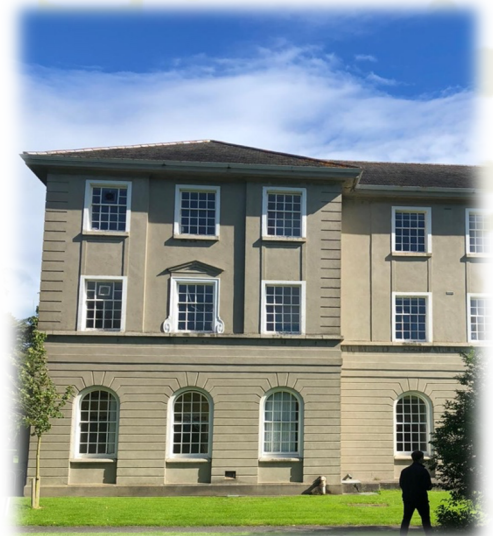
UCD CTC Carysfort, Blackrock