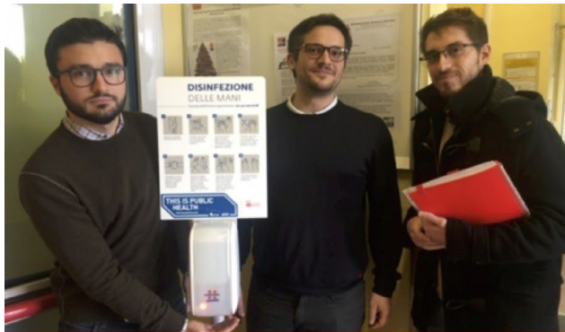
COVID-19 EMERGENCY - Three Residents of the Vita-Salute San Raffaele University School of PH - where the campaign THIS IS PUBLIC HEALTH is underway - are placing a gel dispenser.

One way our Members are sharing their COVID-19 activities is through the ASPHER Blog.