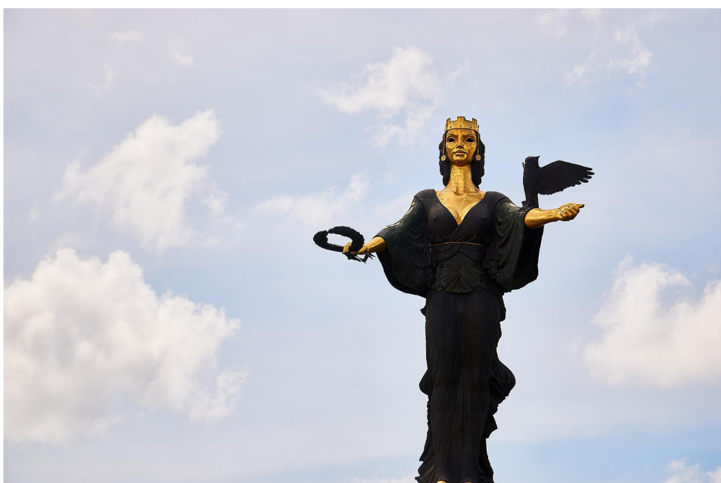
Image: Sveta Sofia, Alexandrov Boulevard, Sofia, Bulgaria.