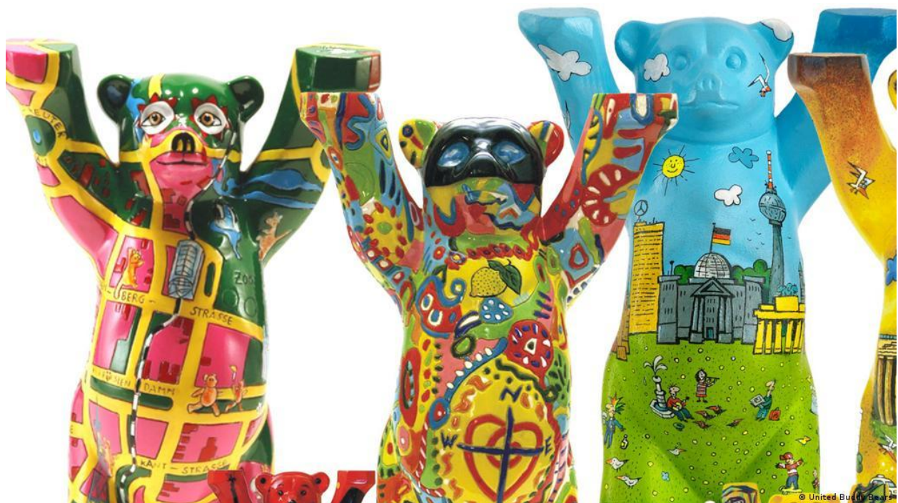
Image: The Buddy Bears - Berlin, Germany