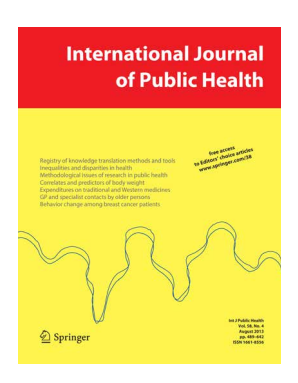
Impact Factor 2018: 2.373